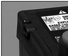
Side vents eliminate acid leaks up to a 45° tilt and keep the battery top dry and corrosion-free.