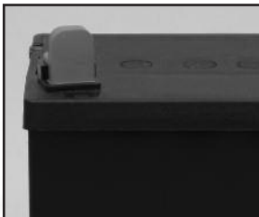
Flush cover designs are maintenance-free allowing easy installation, replacement, and cleaning.