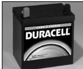
Tough, polypropylene case and cover resists external damage and cracking from demanding outdoor use.